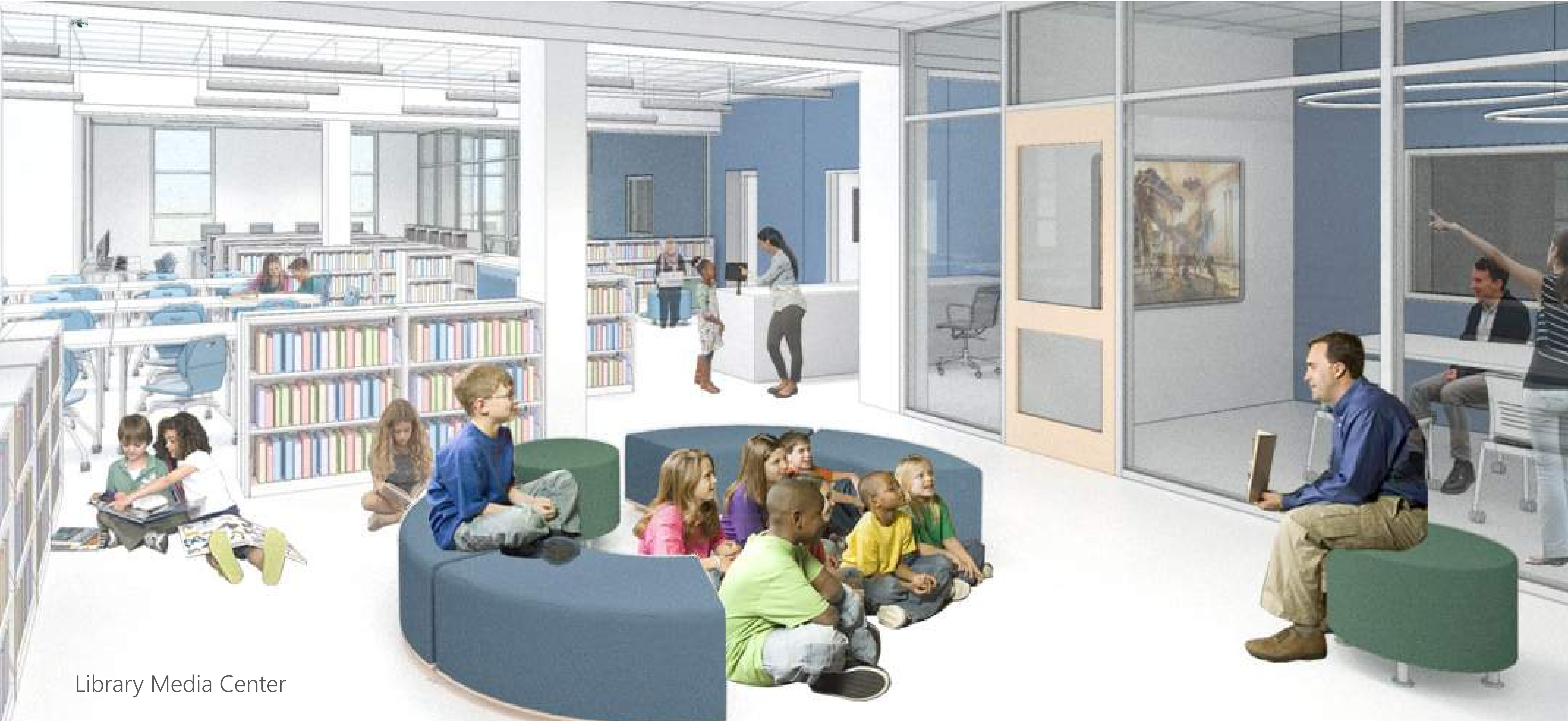
Library Media Center